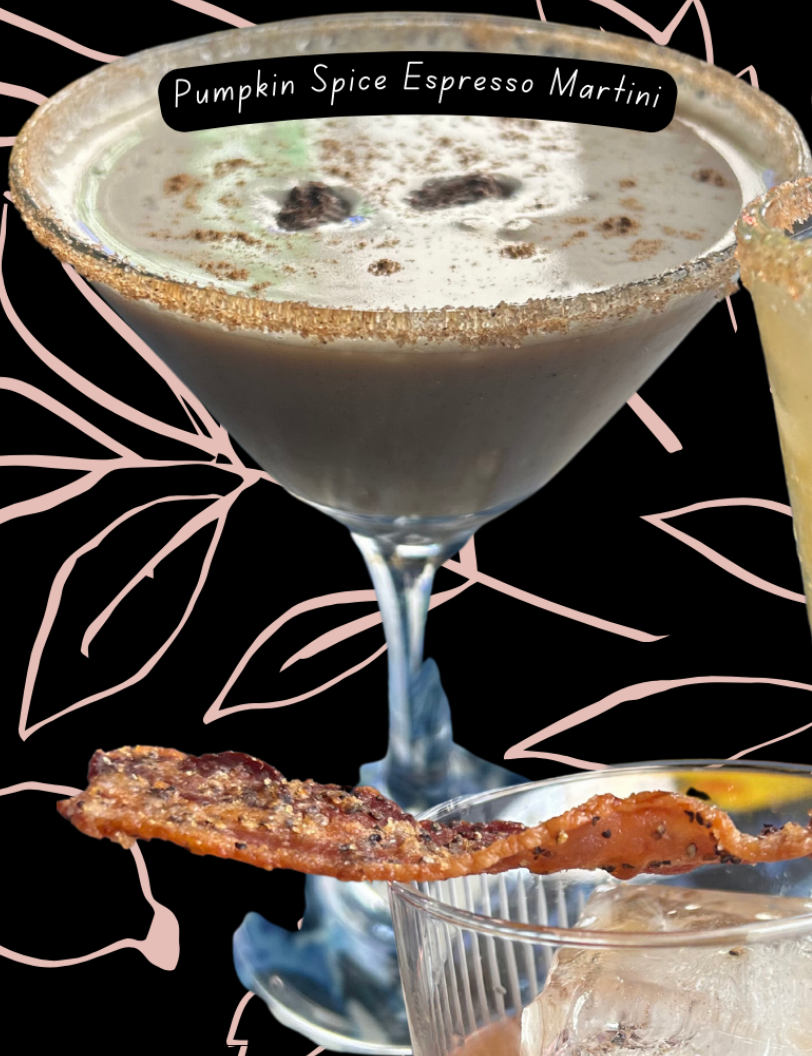
Pumpkin Spice Espresso Martini